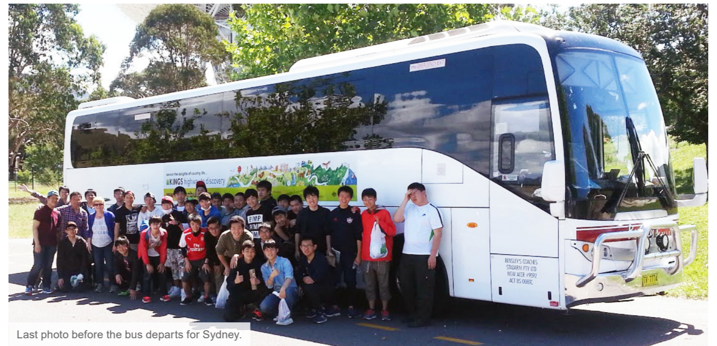
Last photo before the bus departs for Sydney.