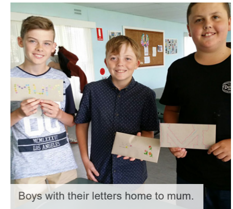
Boys with their letters home to mum.