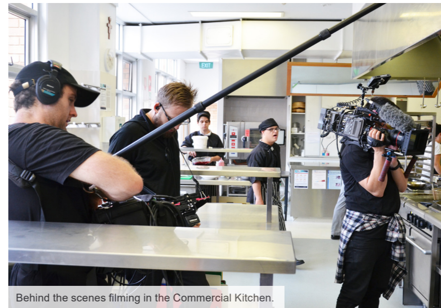
Behind the scenes filming in the Commercial Kitchen.