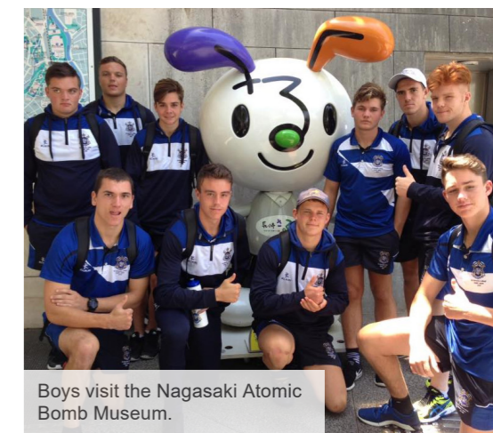
Boys visit the Nagasaki Atomic Bomb Museum.