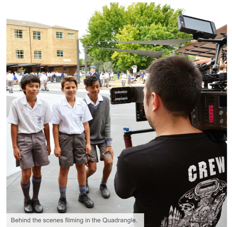
Behind the scenes filming in the Quadrangle.