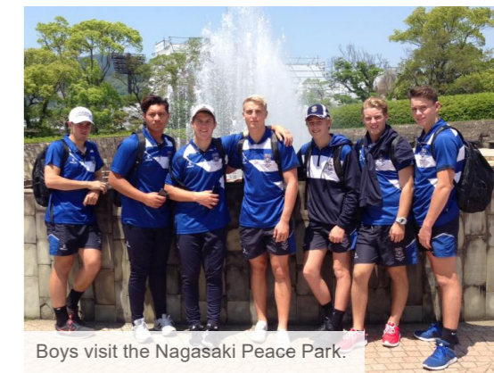
Boys visit the Nagasaki Peace Park.