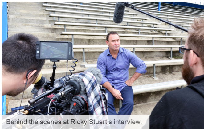
Behind the scenes at Ricky Stuart's interview.