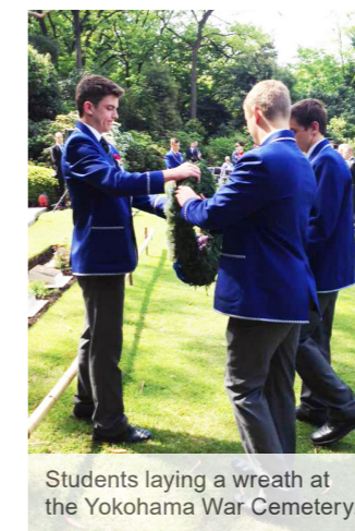
Students laying a wreath at the Yokohama War Cemetery.