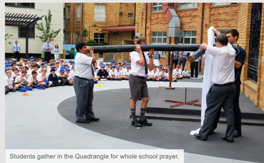
Students gather in the Quadrangle for whole school prayer.

“Together we are able to provide a strong show of force for good in our community”.