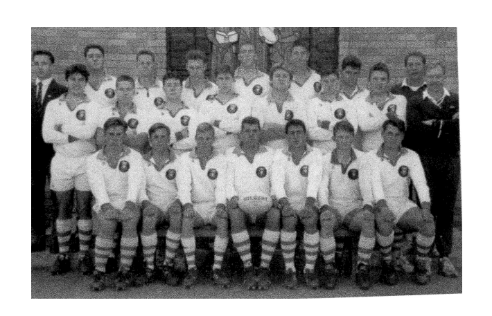
- 1992 First XV -