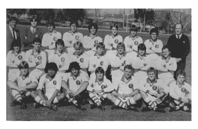
- 1982 First XV -