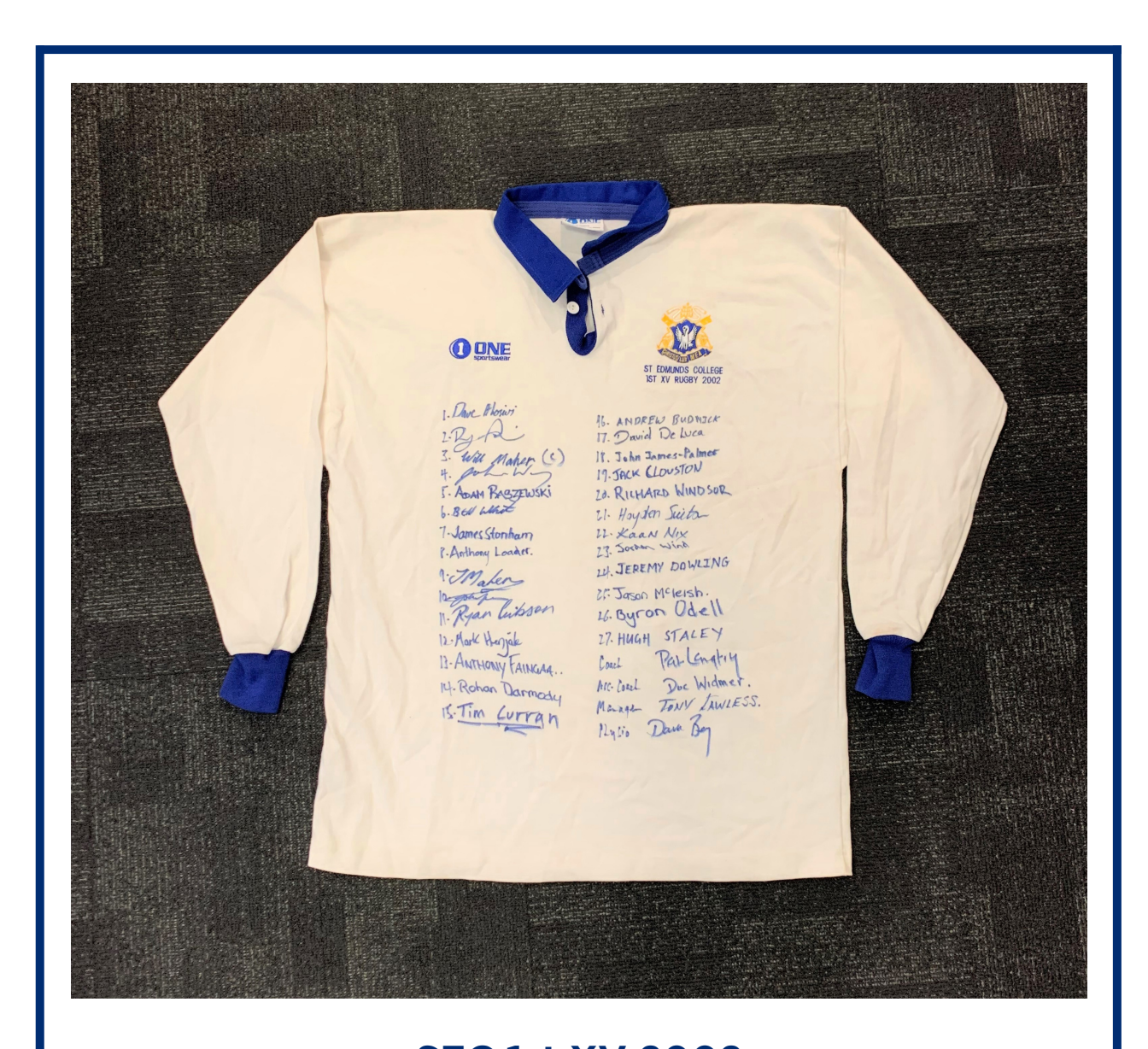
- SEC 1st XV 2002 Undefeated ACTJRU KO Winners, ASC Champions and Waratah Shield Winners